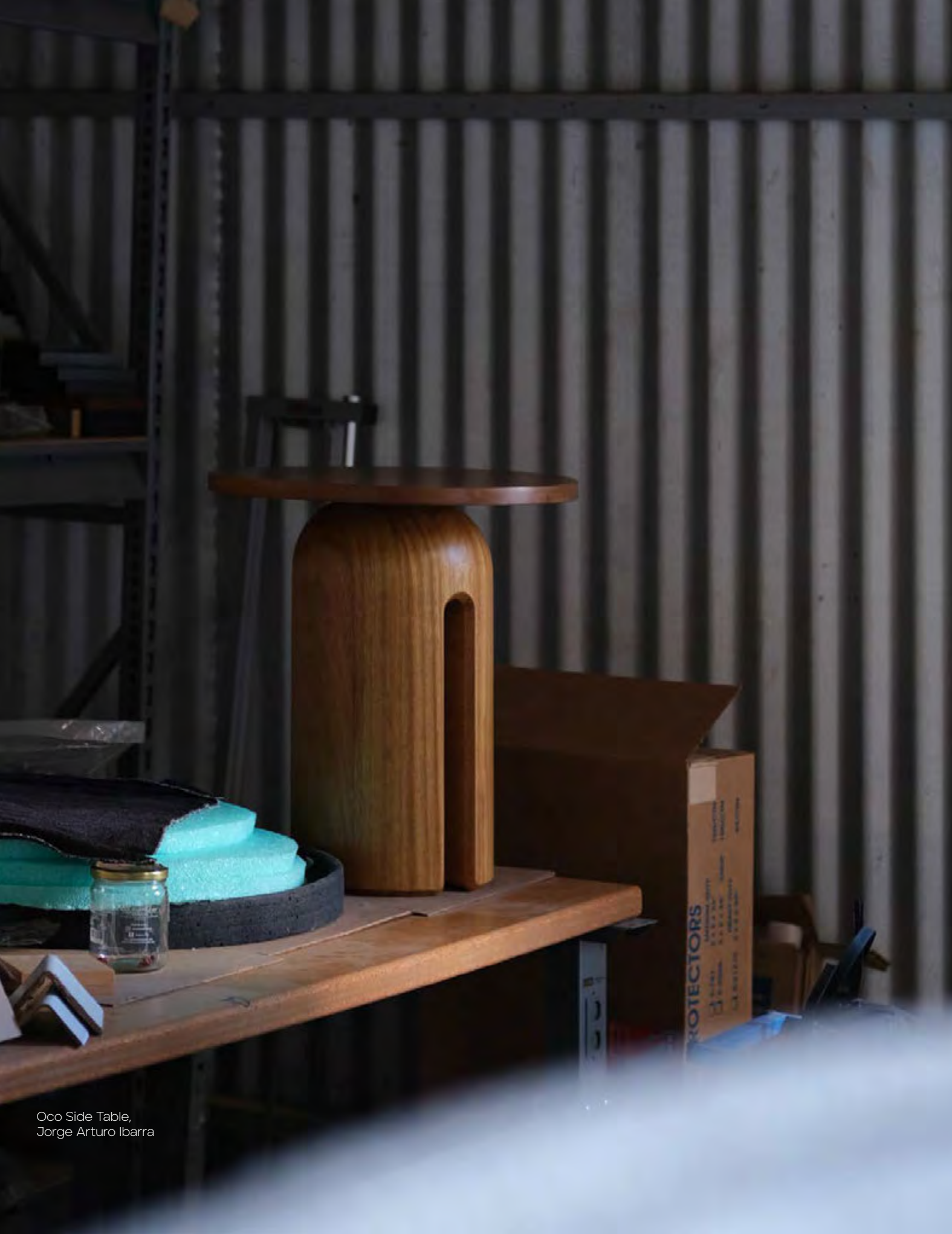
Oco Side Table, Jorge Arturo Ibarra