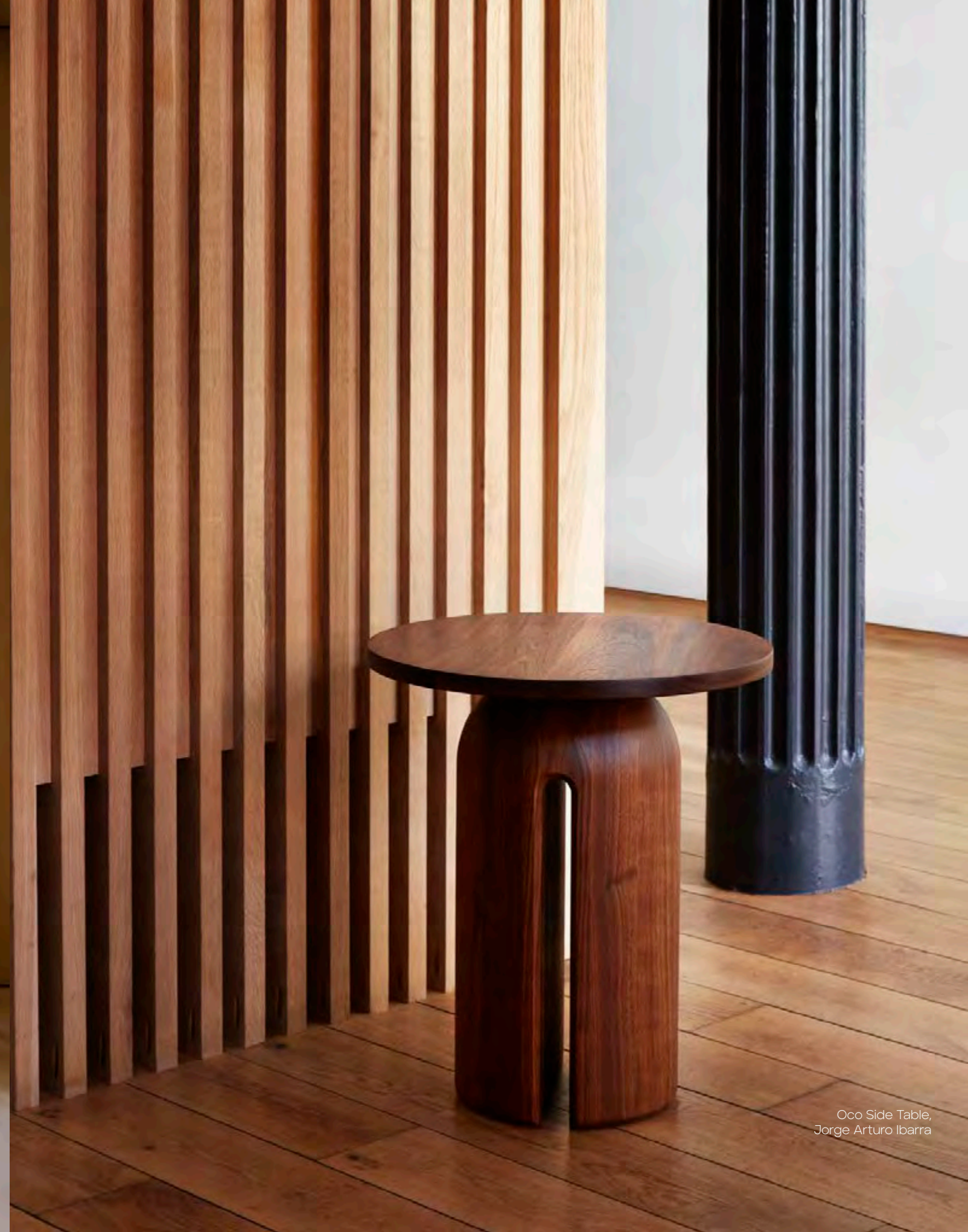
Oco Side Table, Jorge Arturo Ibarra