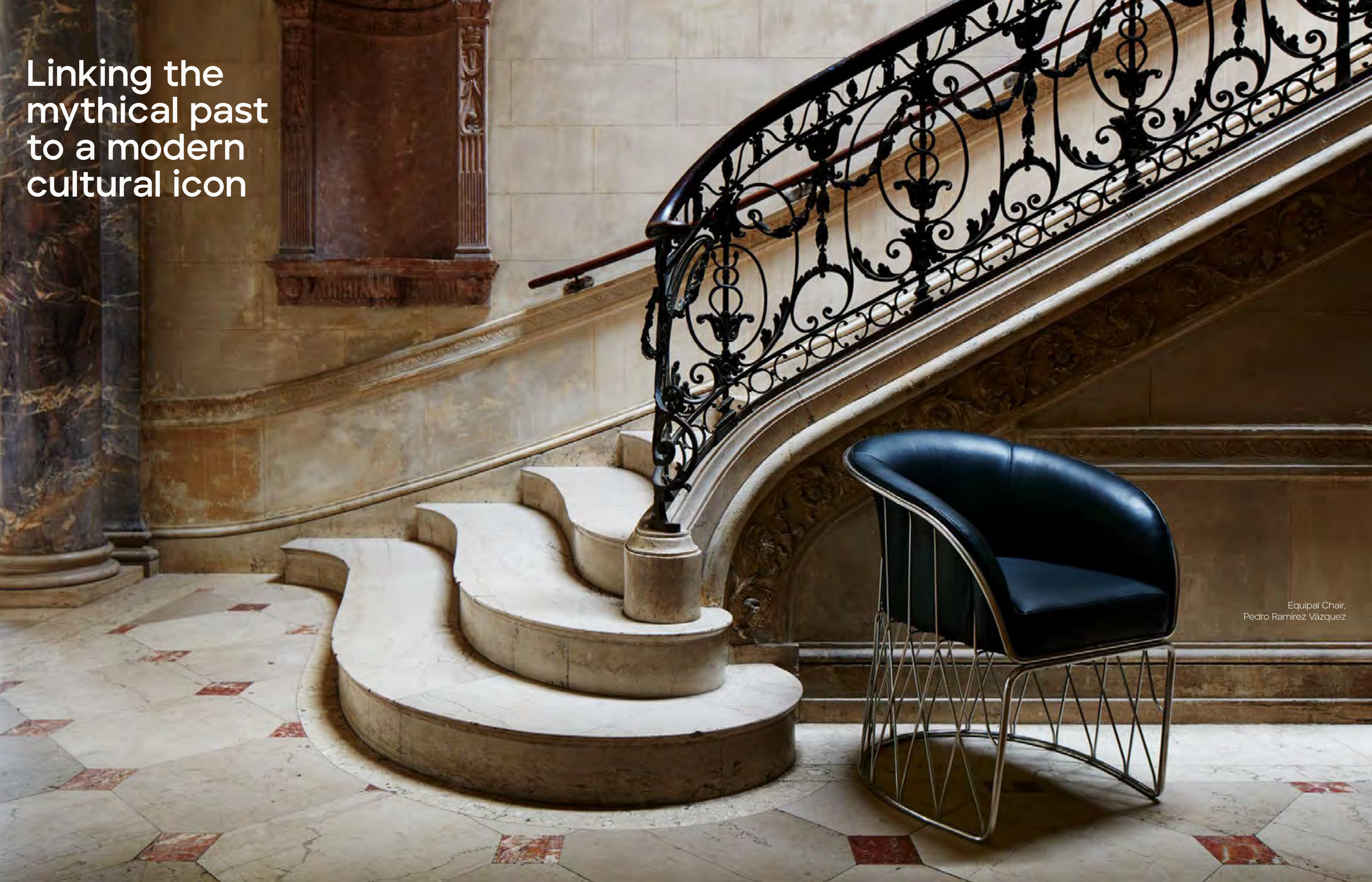
Equipal Chair, Pedro Ramírez Vázquez

Linking the mythical past to a modern cultural icon